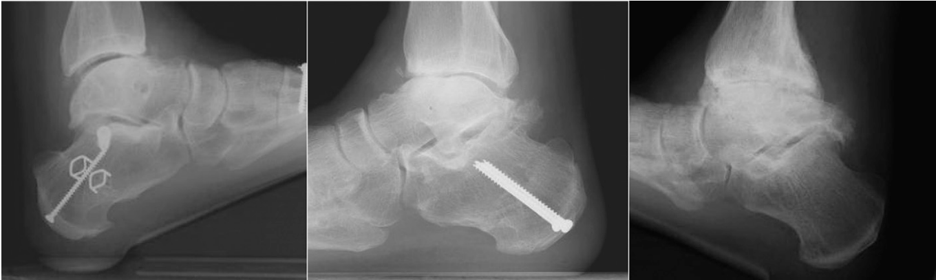
Fig. E-1 Spectrum of radiographic findings at the time of follow-up. Left Forty-year-old man who had an AOS score of 29 after 6.7 years of follow-up. Middle Sixty-year-old man who elected to proceed with a total ankle arthroplasty after 7.4 years of follow-up. Right Sixty-three-year-old man who had an AOS score of 62 after 9.3 years of follow-up and declined additional treatment.